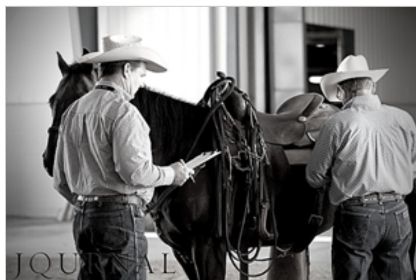
To learn more about AQHA's efforts to promote animal welfare, visit www.aqha.com/animalwelfare.

Based on a recommendation from the AQHA Animal Welfare Commission, the AQHA steward program is being redesigned and rebuilt from the ground up. The AQHA Steward Task Force was appointed by the AQHA Executive Committee to assess the current program and develop ideas for enhancements.